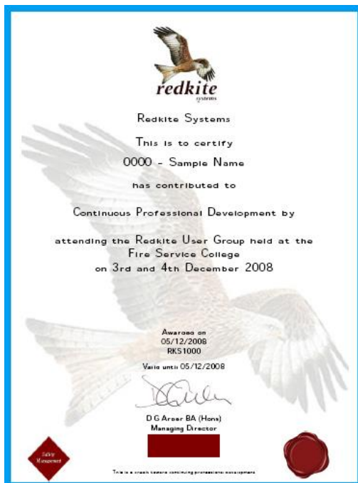
A sample certificate / license - all images and wording can be changed to suit your needs.

You can quickly produce custom certificates or licenses using the simple but effective design tools included with the Redkite Certificate / License Manager.